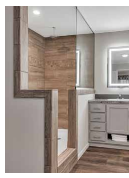
SERENITY SHOWER W/ OPTIONAL 1/2 GLASS