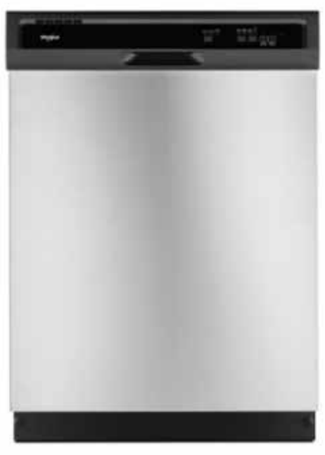
STAINLESS STEEL DISHWASHER