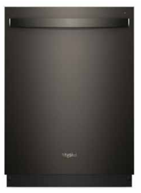
BLACK STAINLESS STEEL DISHWASHER