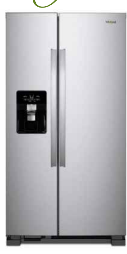
21CF STAINLESS STEEL SXS REFRIGERATOR