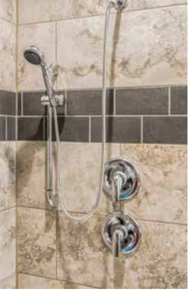
SHOWER WAND (INCLUDED W/ SERENITY SHOWER)