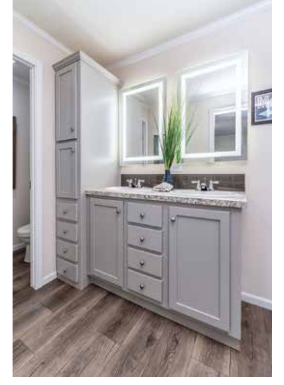
006 LINEN CABINET