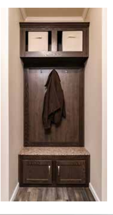
033 HALL TREE