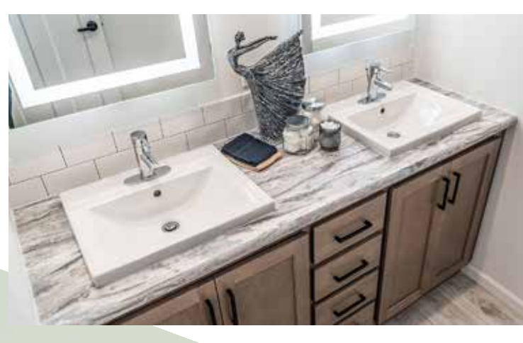
SQUARE SINK INCLUDES EURO FAUCET