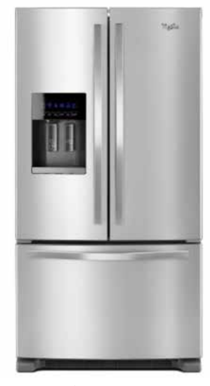
25CF STAINLESS STEEL FRENCH DOOR REFRIGERATOR