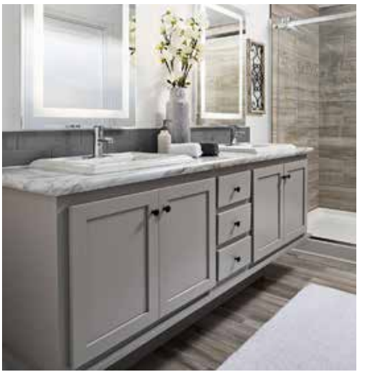
FLOATING BATHROOM VANITY - VBP