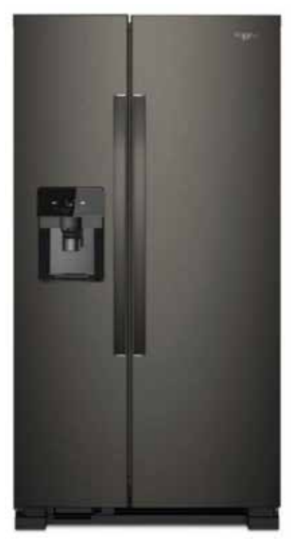
21 CF BLACK STAINLESS STEEL SXS REFRIGERATOR