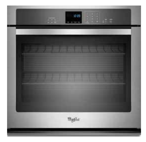
STAINLESS STEEL BUILT IN WALL OVEN (ELECTRIC ONLY)