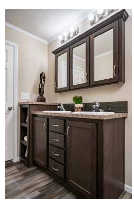
TRI VIEW MEDICINE CABINET