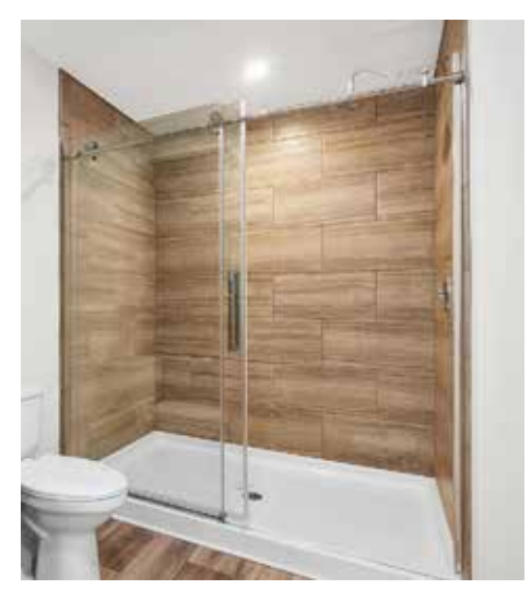
48"X72" LUXE 3-SIDED CERAMIC SHOWER W/ BARN SLIDING DOOR