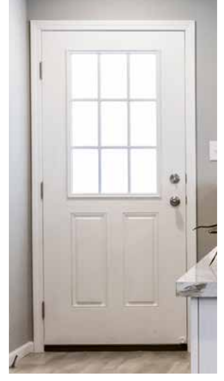
9 LITE RESIDENTIAL DOOR