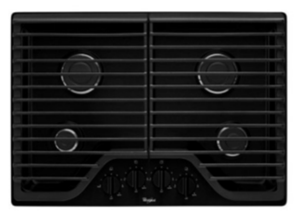
BLACK GAS COOKTOP