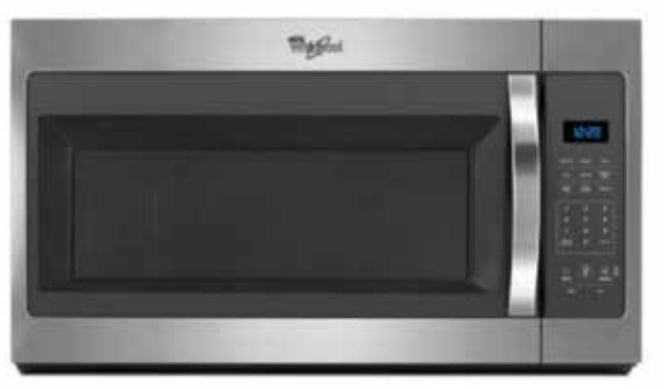
STAINLESS STEEL OVER THE RANGE MICROWAVE (AVAILABLE AS BUILT IN)