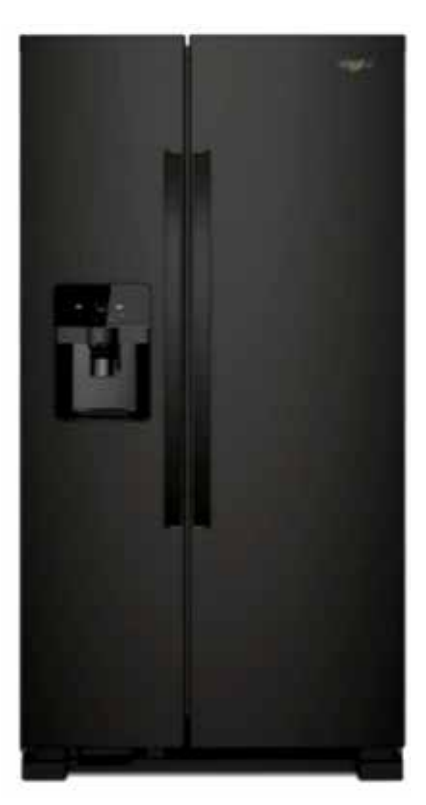
21CF SXS BLACK REFRIGERATOR