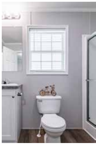
30" X 36" WINDOW