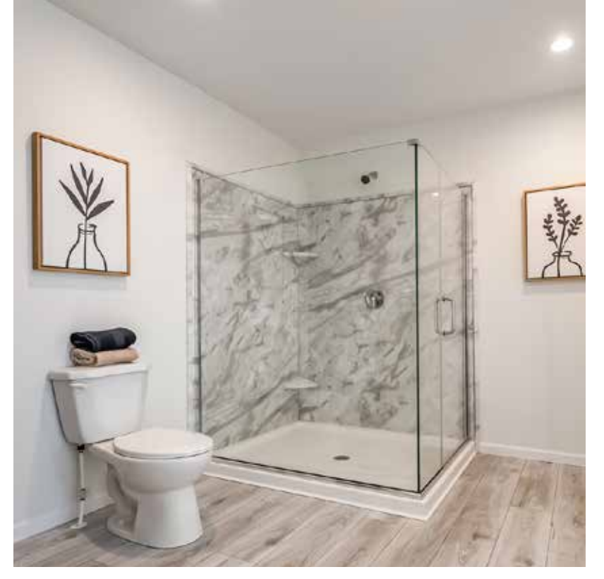
2-SIDED AGILE SHOWER