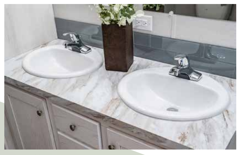
METAL LAV FAUCETS