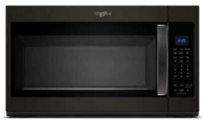
BLACK STAINLESS STEEL OVER THE RANGE MICROWAVE (AVAILABLE AS BUILT IN)