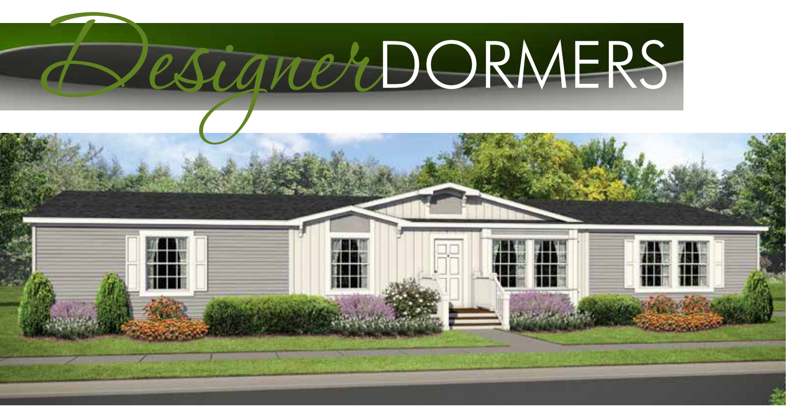
DOUBLE DORMER W/ 10' FAUX BUMP OUT "D3"