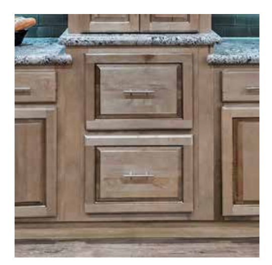
POT & PAN DRAWERS