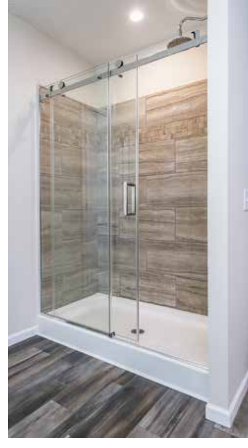
3 SIDED CERAMIC SHOWER W/ BARN SLIDING DOOR