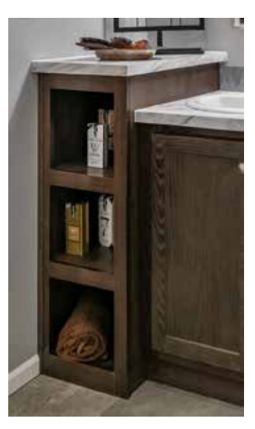
074 HALF STACK LINEN CABINET