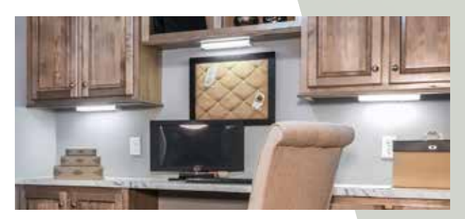
UNDER CABINET LIGHTING W/ OPT BOTTOM TRIM