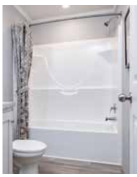
STANDARD 60" TUB/SHOWER