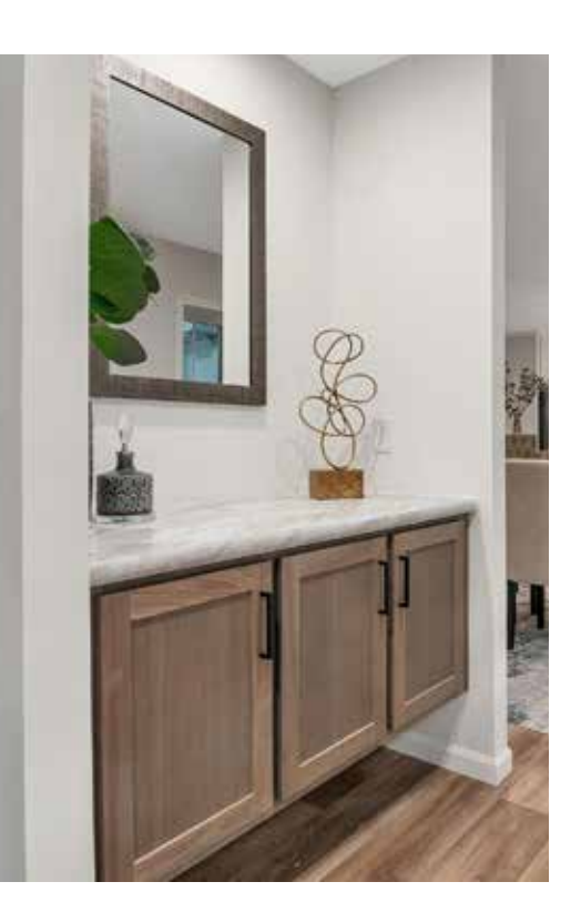
097 FLOATING CABINET