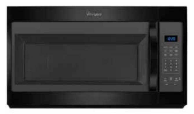
BLACK OVER THE RANGE MICROWAVE