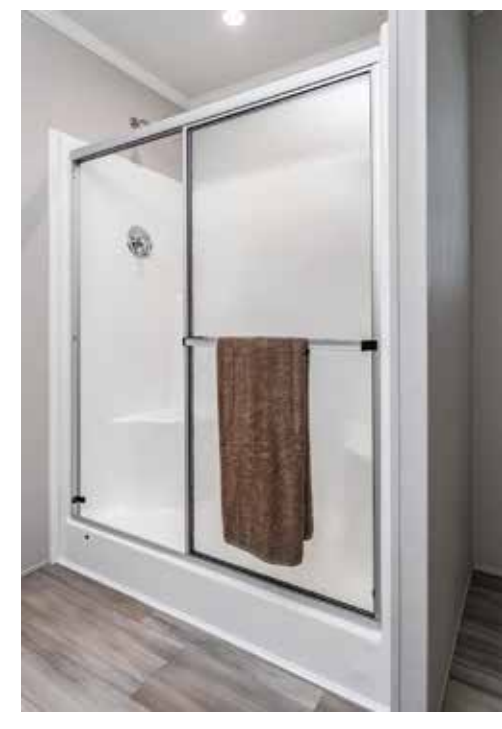
60" FIBERGLASS SHOWER