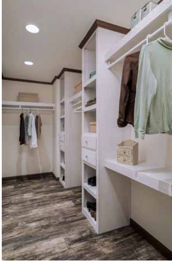
CLOSET ORGANIZER - VBP