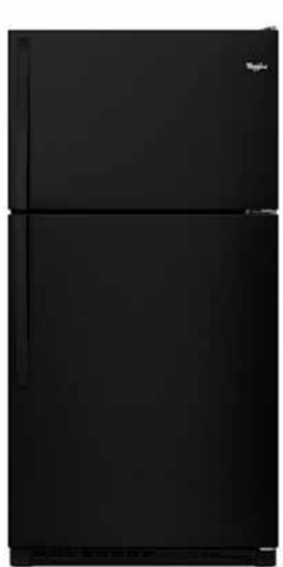
21CF O/U BLACK REFRIGERATOR