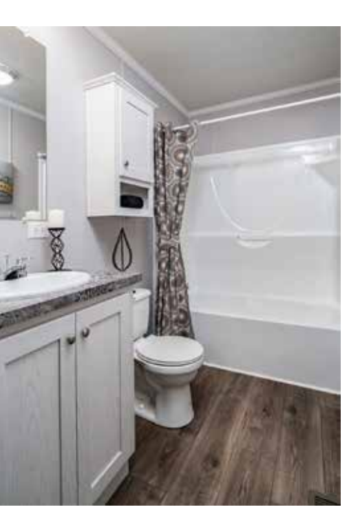
LINEN OVER COMMODE