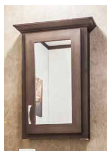
SINGLE VIEW MEDICINE CABINET