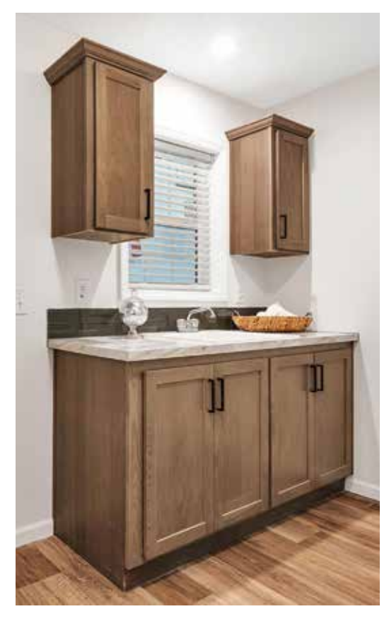
066 LARGE UTILITY SINK