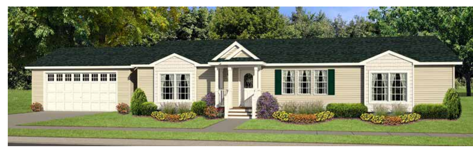
D23 ELEVATION W/ OPTIONAL SHAKE SIDING (PORCH ONSITE BY OTHERS)