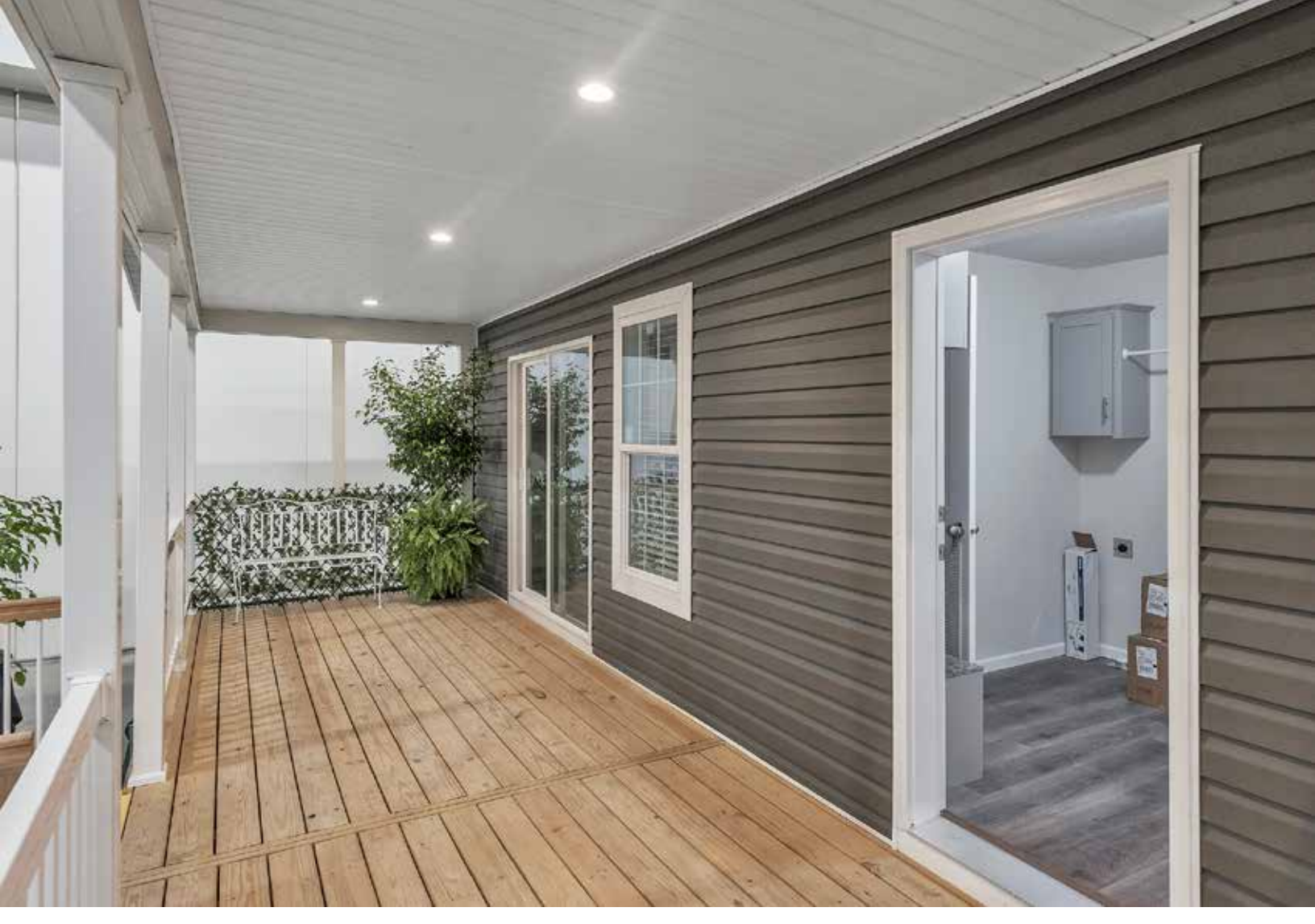
8' PORCH (VBP)