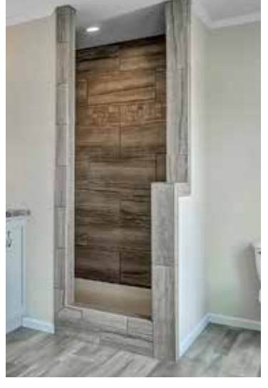
SERENITY SHOWER W/ STANDARD FULL WALL