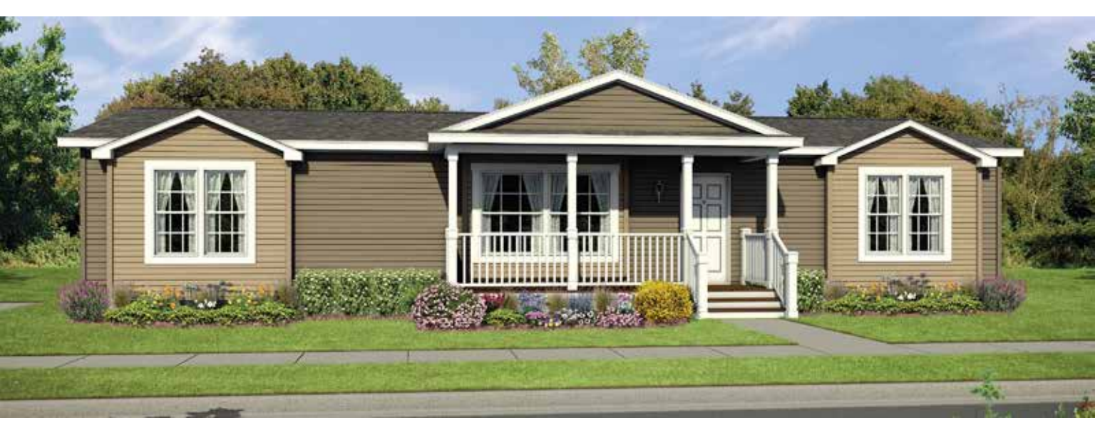
D24 ELEVATION 10'DROP EAVE DORMER W/ 6" BUMP OUT (PORCH ONSITE BY OTHERS)