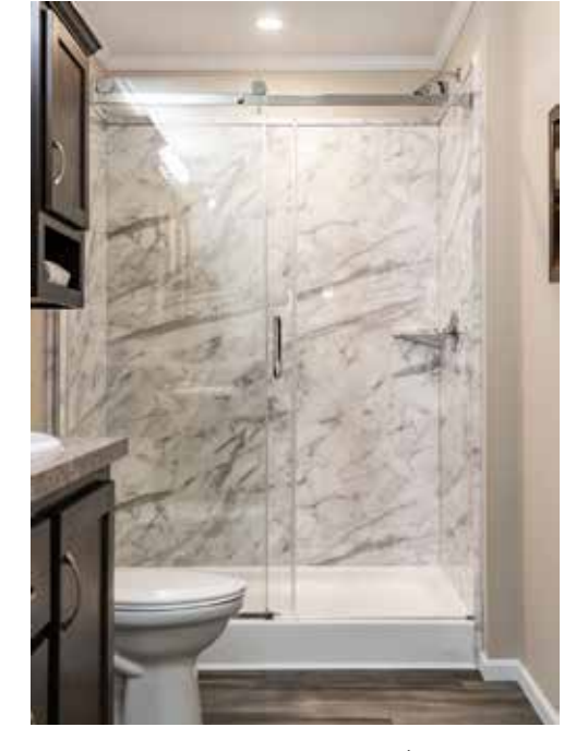
3 SIDED AGILE SHOWER W/ BARN SLIDING DOOR