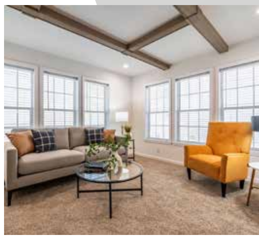
089 ENTERTAINMENT WALL