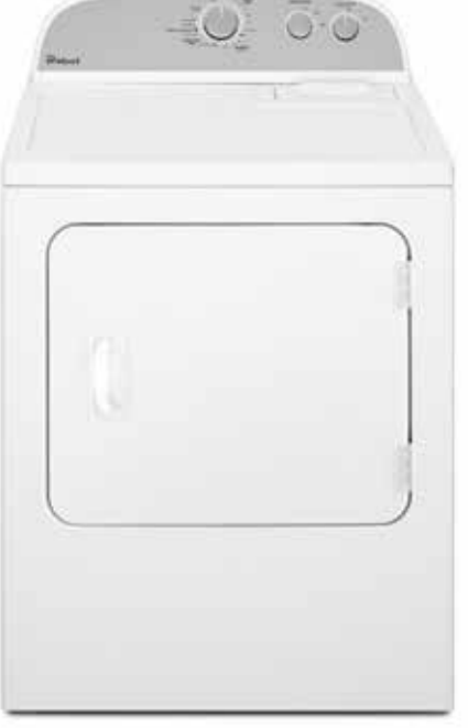
WHITE ELECTRIC DRYER